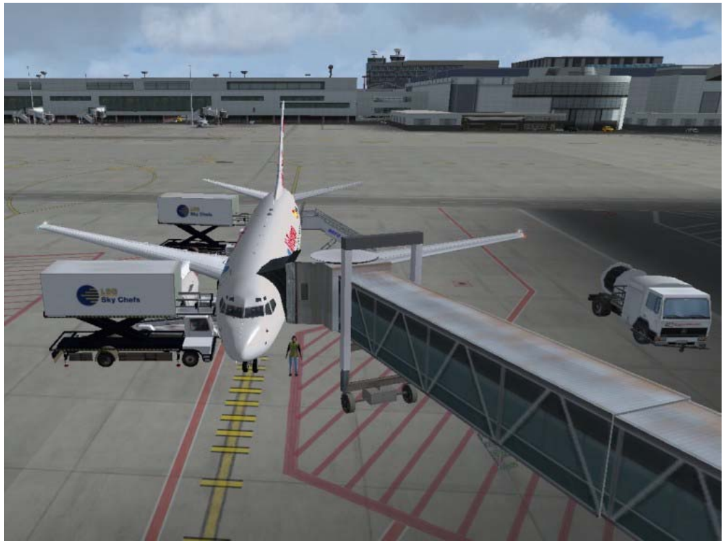
Animated Catering Trucks and the Fuel Bowser On Station EBBR2008 Scenery