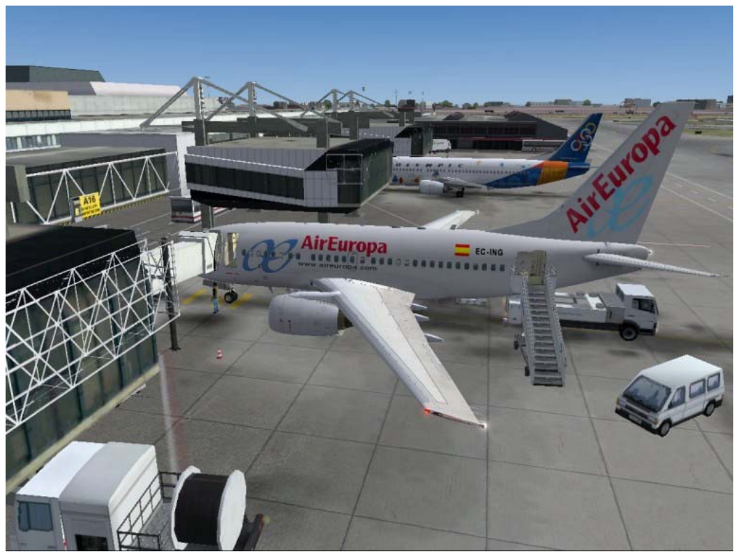
Gate A16 LPPT Aerosoft Lisbon 2008 Scenery

Once the aircraft is 'docked' it now becomes possible to 'request' the Cleaning Truck, The Caterers and the Fuel Bowser (or tanker, depending on the gate). All dutifully attend (for a predetermined timescale which is configurable) and then depart.