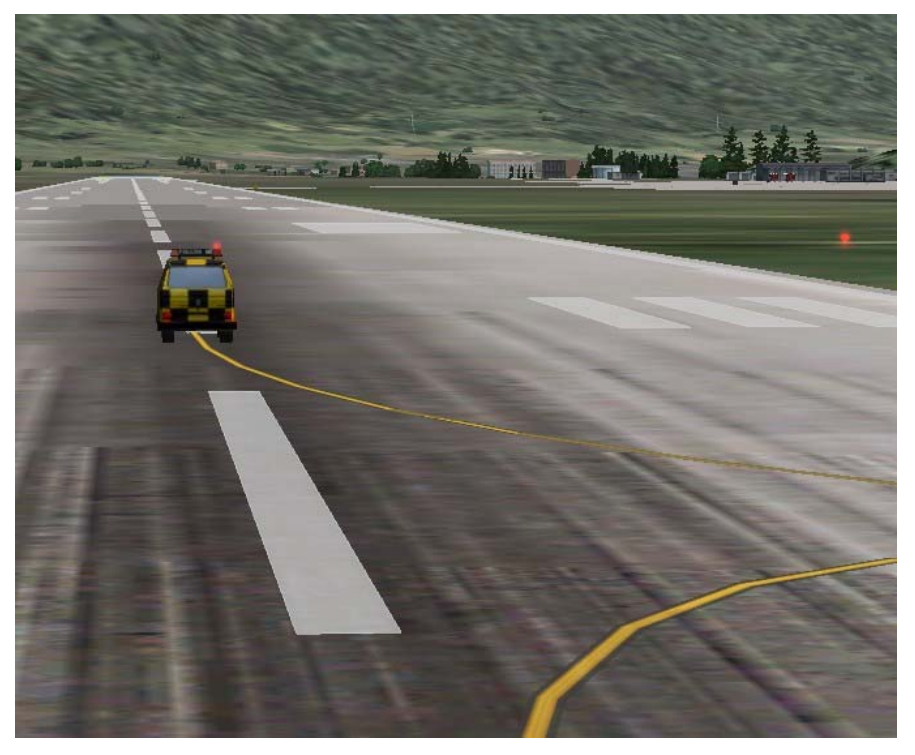
The FOLLOW ME CAR (has working indicators so you know where he's turning)

All in all a 'MUST HAVE' addition to your setup. The extra traffic and interaction takes you up a level. Very enjoyable and realistic to use. I loved it, but I found myself buying two more scenery files and bringing LEMD LPPT and EDDF into the route network :o)) Try it, you've nothing to loose.