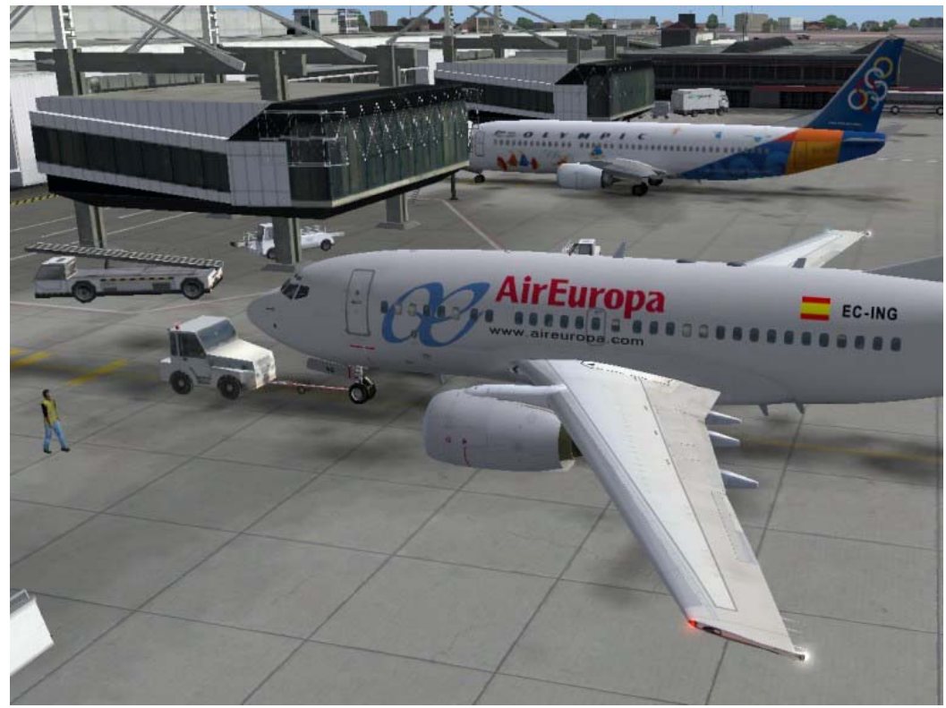
Very Accurate 'Pushback' right on the taxi line using the Tug LISBON2008 Scenery