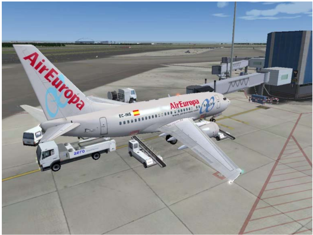
LEMD2008 Scenery Here's the Fuel Bowser, Baggage Conveyors and don't you just love the Toilet Truck :o))